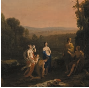
Detail from Landscape with the Judgement of Paris , 1633