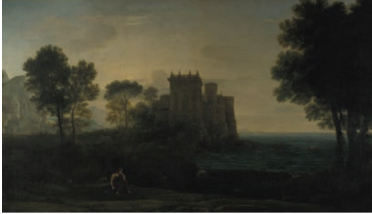
Landscape with Psyche Outside the Palace of Cupid, c.1664