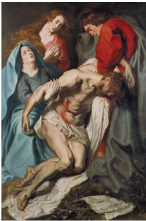
The Deposition , c.1619 Sir Anthony van Dyck BAROQUE GALLERY (46)

BRITAIN & ITALY (46) - Works by Antonio Canaletto, Goffredo Wals and Giovanni Paolo Pannini