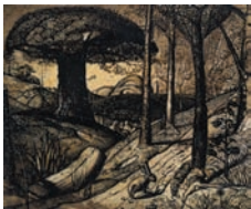
Early Morning , 1825 Samuel Palmer

The Ashmolean's Western Art Print Room houses one of the finest collections of European prints and drawings in Britain. It includes approximately 25,000 drawings and 250,000 prints from the 15 th century to the present day. It is open to members of the public, students and visiting scholars alike, for the study and enjoyment of the collections. Amongst the highlights are drawings and prints by Claude Lorrain, the world's finest group of drawings by Raphael, works on paper by Rembrandt, Dürer, Guercino, Watteau and Cézanne; English drawings and watercolours by JMW Turner and Samuel Palmer; the Pissarro family archive and John Ruskin's teaching collections. For more information please visit: www.ashmolean.org/westernart/printroom