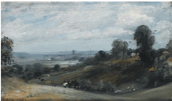
The Vale of Dedham from Langham , 1832 John Constable OIL SKETCHES (50–51)