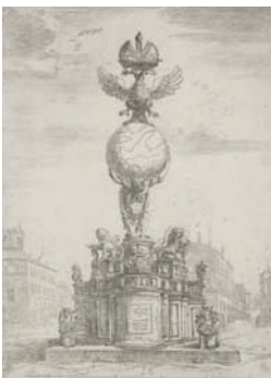
Atlas Supporting the World Etching and drypoint, 194 x 138 mm. WA1855.541.2

Etching, 195 x 139 mm