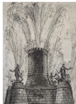
The Round Tower with Exploding Fireworks

Etching, 195 x 136 mm