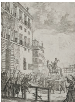
The Equestrian Statue is Guided to the Palazzo di Spagna Etching, 194 x 137 mm

Etching, 195 x 136 mm