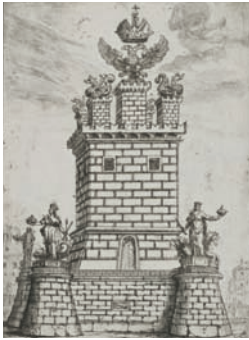
The Square Tower Etching, 193 x 140 mm