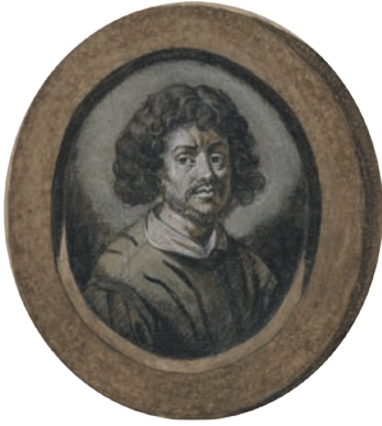
Portrait of Claude possibly a self-portrait, used as a frontispiece to the Liber Veritatis