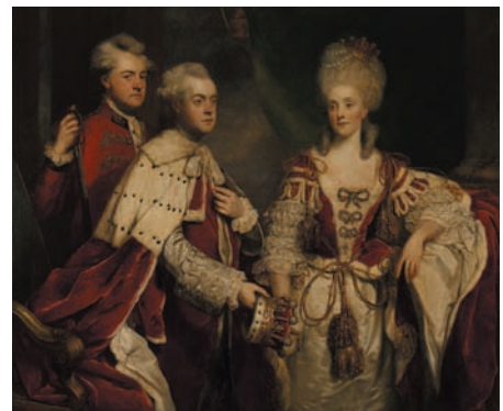
Earl Harcourt, his Wife and Brother , 1780–81 Sir Joshua Reynolds EUROPEAN ART (44)